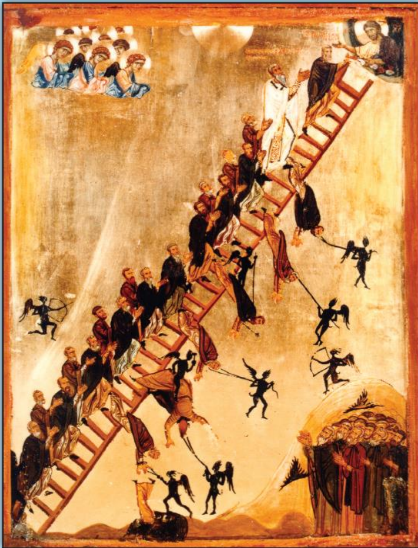
Icon of the the Ladder of Divine Ascent